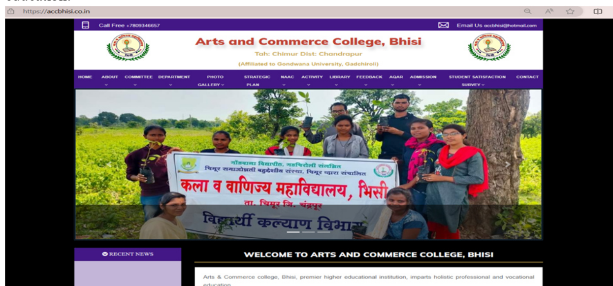
Fig 1. Home Page

iterative approach allows for the identification of user needs, preferences, and pain points, which inform strategic decisions regarding website architecture, content organization, navigation pathways, and interactive features. Additionally, the research model incorporates elements of usability testing, A/B testing, and user behavior analysis to validate design hypotheses, measure performance metrics, and iterate on improvements iteratively. By adopting a rigorous and evidence-based research model, the Arts and Commerce College, Bhsi website aims to evolve in tandem with the evolving needs and expectations of its users, thereby enhancing its value as a vital hub for information, resources, and community engagement in arts and commerce education.