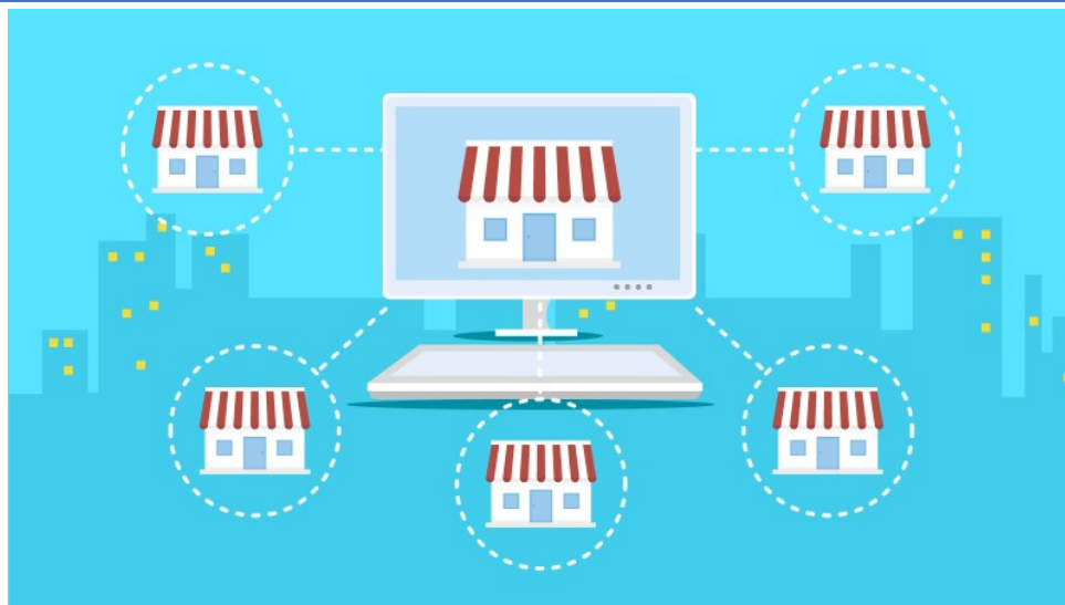
Fig 3: Distribution of Franchisee Stores