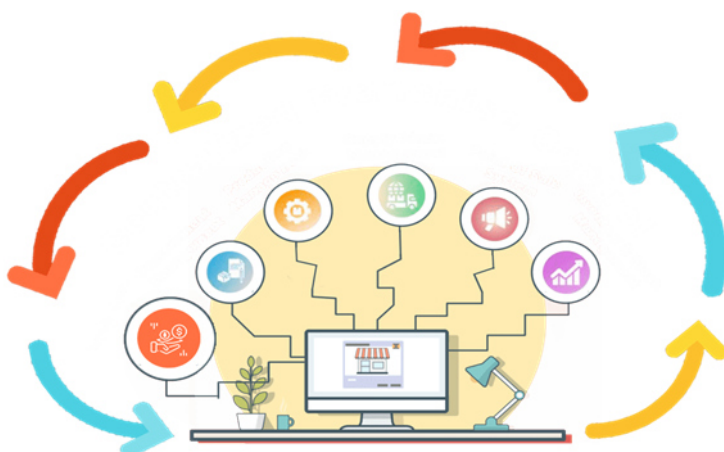
Fig 4: How Franchisee Works